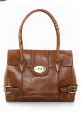
0186 26 x 34 x 12cm (H, W, D) Tan