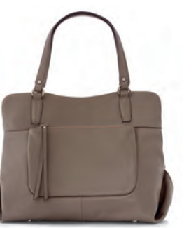
0178 30 x 38 x 13cm (H, W, D) Taupe