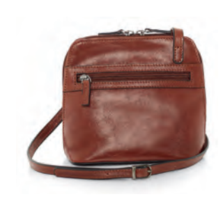
0179 17 x 17 x 16cm (H, W, D) Black, Burgundy, Chestnut