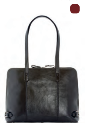
0177 28 x 37 x 10cm (H, W, D) Black