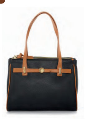
0187 24 x 31 x 13cm (H, W, D) Black