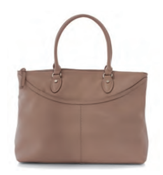
0180 33 x 40 x 14cm (H, W, D) Beige