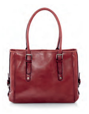
0175 30 x 38 x 11cm (H, W, D) Red