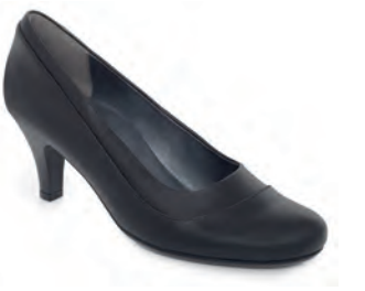
51777 Sizes 3 - 9 (incl. 4½, 5½, 6½, 7½) Black