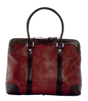
0148 30 x 38 x 7cm (H, W, D) Chestnut