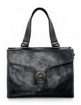
0185 26 x 35 x 11cm (H, W, D) Black