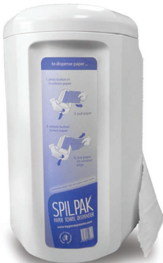
HD/26 Spilpak Paper Dispenser